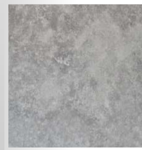
1703 Silver Stone