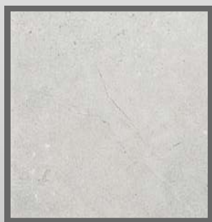
1701 Desert Rock

Bring the raw, sophisticated beauty of nature into your space with the bold and authentic design of the SPC Stone Series. This collection captures the distinct texture and elegant look of natural stone, offering a foundation of timeless class and modern refinement. YOU RA provides high-durability, waterproof, and easy-to-maintain SPC Flooring, specifically designed to withstand heavy use while enhancing the luxurious feel of your place and home.