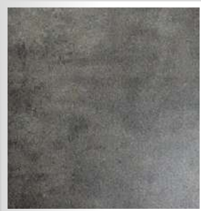
1702 Grey Concert